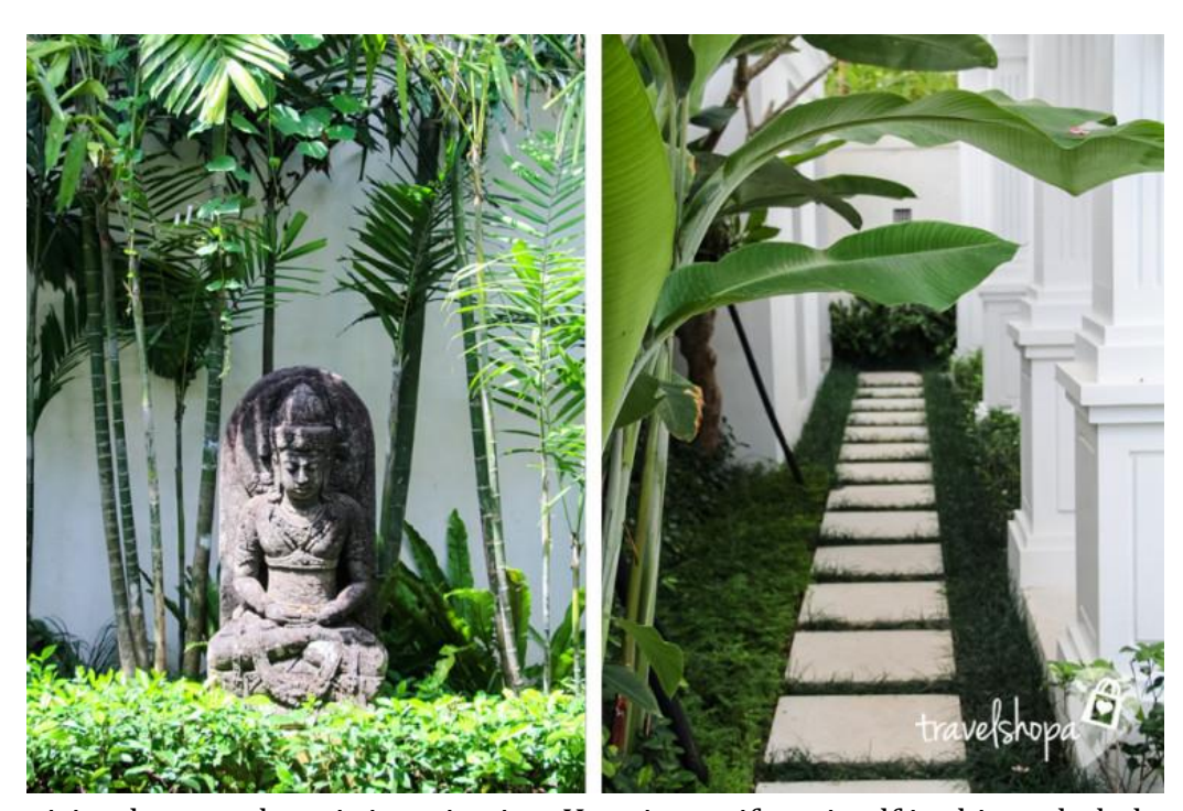
Bali's spiritual atmosphere is intoxicating. Here it manifests itself in this secluded tropical garden.