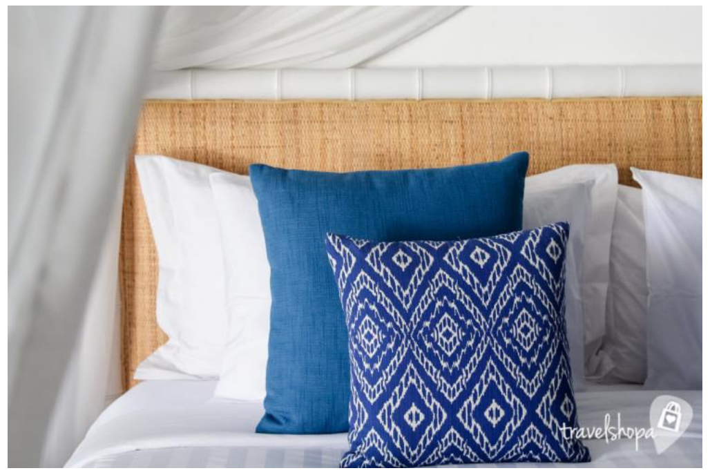
Draped four-poster beds beautifully laid out with intricately patterned pillows and cushions usher in a dreamless sleep.