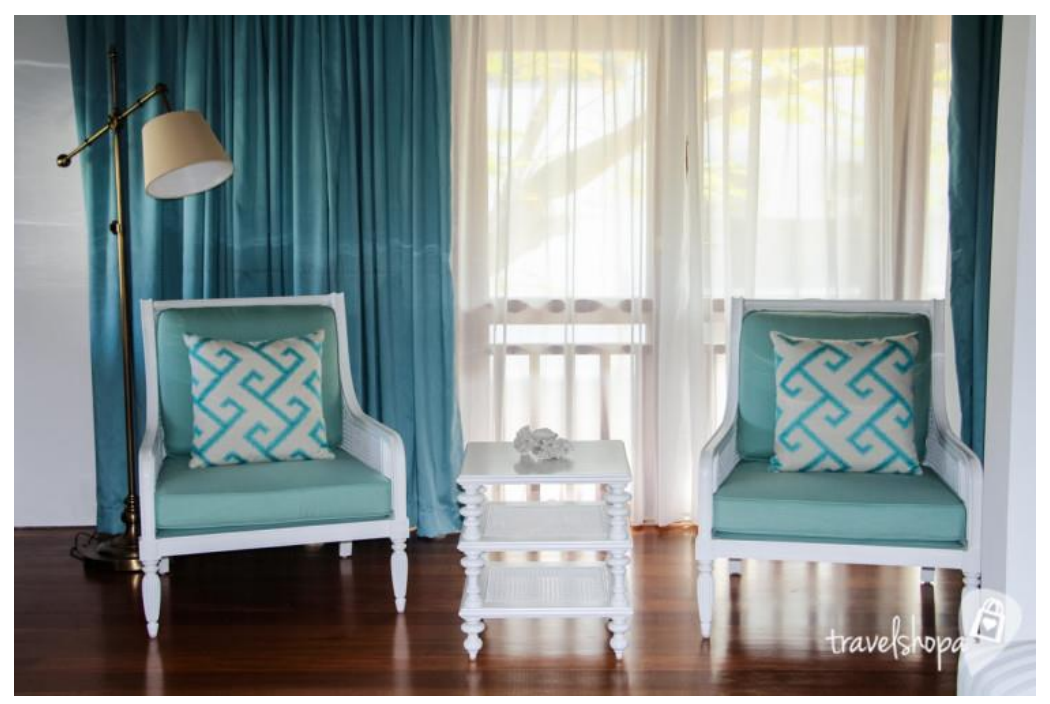
Whitewashed furniture and resort-style accents in a refreshing blue and bright white colour palette livens up the interior space.