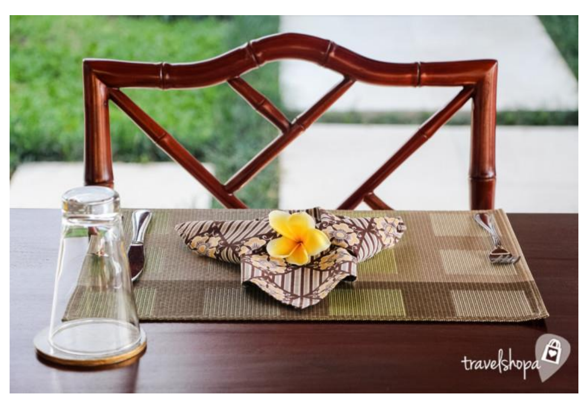
Breathtaking attention to detail and attentive round-the-clock service plump up our holiday experience.