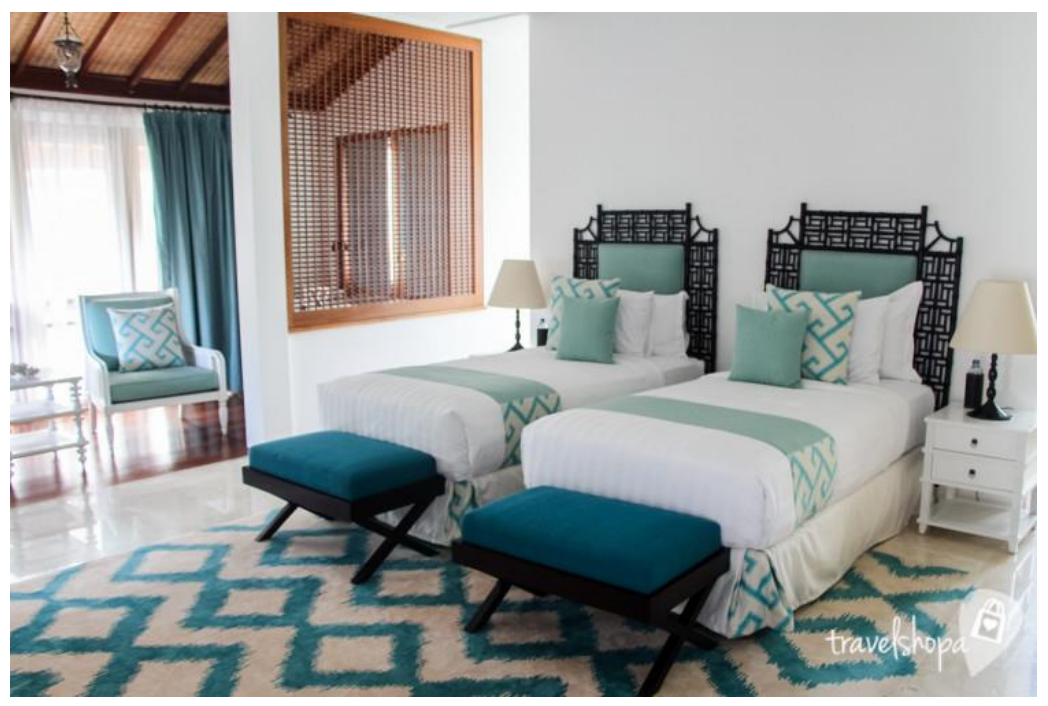
Gleaming marble and parquet wood floors are matched with geometrical patterned ikat rugs and coordinating bed settings in the spacious bedrooms.