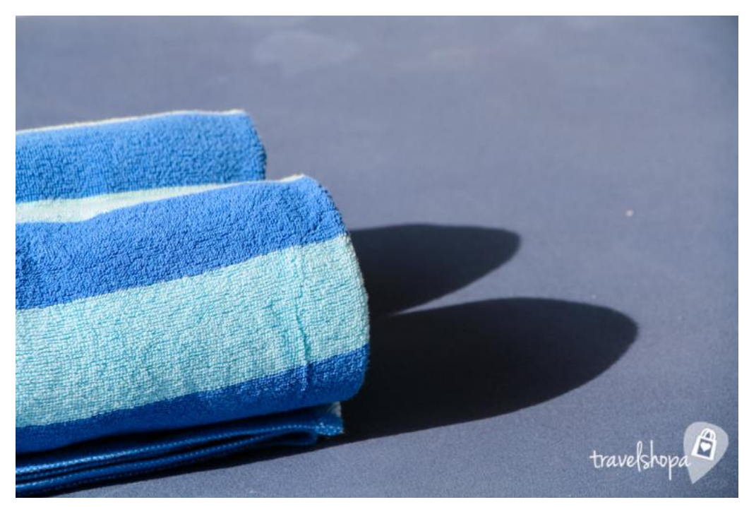
Even the pool towels are colour coordinated!