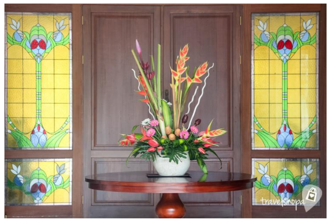
Stain-glass windows and a vibrant floral centerpiece stage a great welcome party for guests.