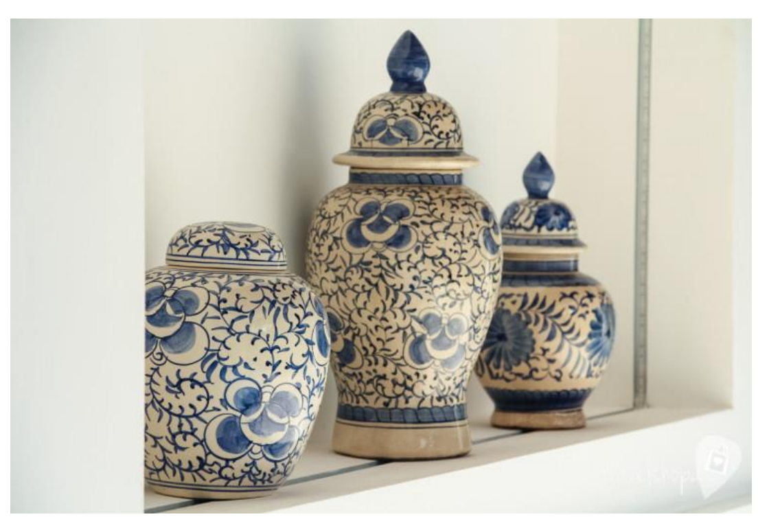
Ornate handpainted ceramic wares are a Balinese specialty and there's plenty to admire here at the Villa.