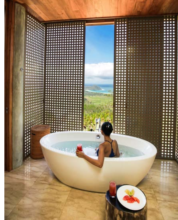
Above: Lavish bathroom with sliding doors and ocean views Top left page: Private pool villas, Bottom left page: View from Villa Right page: Gastronomy delights, Aura Restaurant and bar