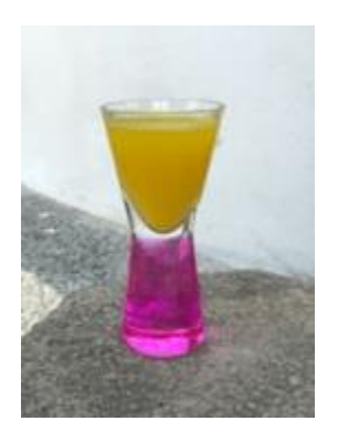
-Pure Heart (The Heart Chakra)

Composed of cucumber, kale, parsley, celery, ginger juice and lime juice, the green chakra is connected with love, relationships, integration and compassion.