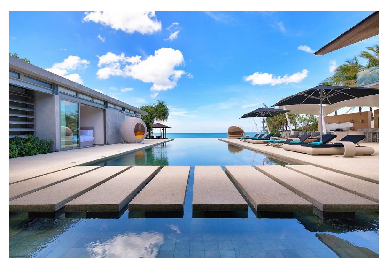
Villa Tievoli – Absolute beachfront

simultaneously expanding the brand's reach in more dream destinations throughout Asia and other key regions."