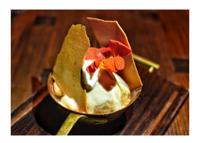
SALTED CARAMEL SEMIFREDDO

SLOW ROASTED, ROLLED PORK BELLY SERVED WITH SALSA VERDE, PATE CREAM SAUCE, LEMON-APPLE JAM AND FRESH FENNEL SALAD