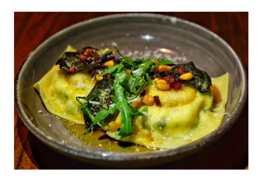
EGG & RICOTTA RAVIOLI WITH WHOLE EGG YOLK, SPINACH AND RICOTTA FILLING, PUMPKIN, SAGE AND PINE NUT SAUCE